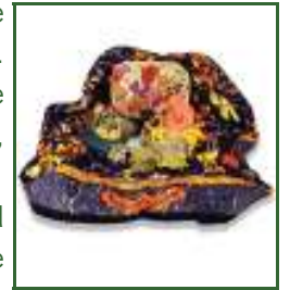
A Taste of our couture accessories

"Our policy is to maintain quality. All items stocked are in perfect condition, pristine, ready for immediate adoption, immediate wear, Nell continues. "In fact, they're fresh as a daisy, she adds. Merchandise is received daily. Every item is authenticate, a bonified treasure, and I believe there's a treasure waiting for each and every inconspicuously frugal shopper."